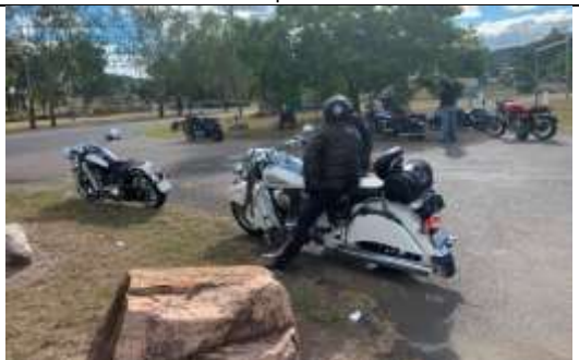
Regrouping at Widgee