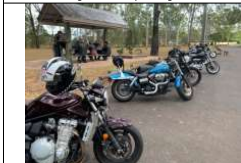
Parked up at Dickabram Bridge #1