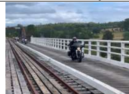
Bikes crossing Dickabram Bridge #3