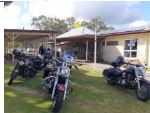
May on the Fraser Coast #9