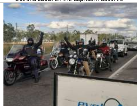
Out and about on the Capricorn Coast #12