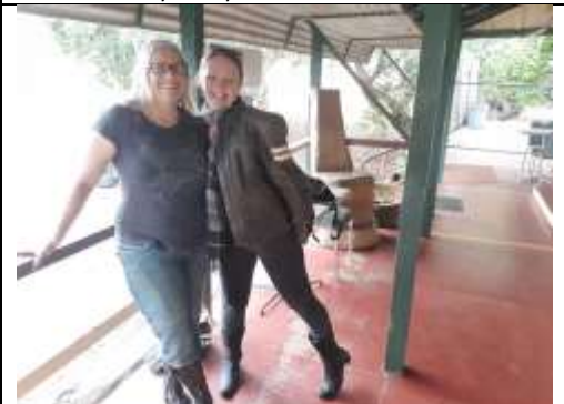
May on the Fraser Coast #7