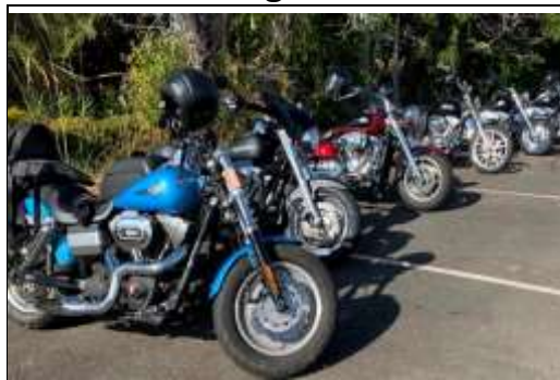
Meeting Puma Maryborough South #1

Easing of Restrictions 17 th May – Dickabram Bridge, Theebine and Howard