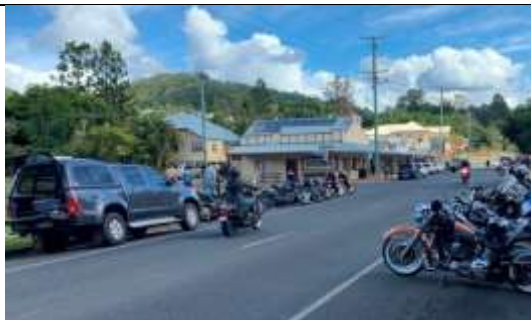
Lunch stop at Imbil #1