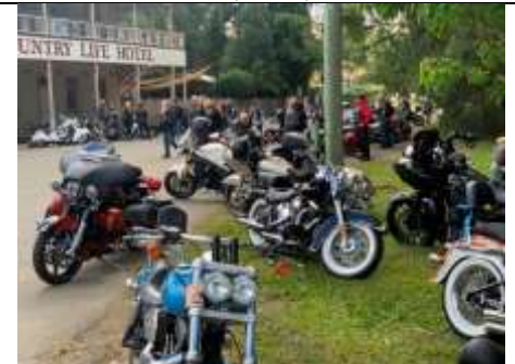
Regrouping at Kin Kin