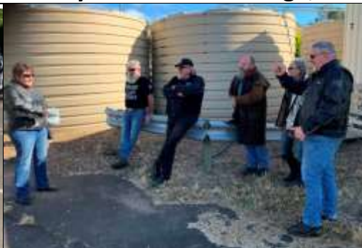
Waiting for others to arrive