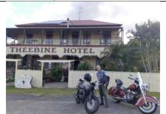
May on the Fraser Coast #8