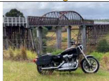
Suka's bike and the bridge