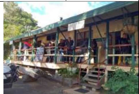
Last beer at The Gundy