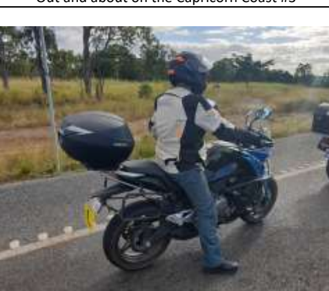
Out and about on the Capricorn Coast #6