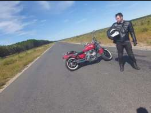
May on the Fraser Coast #5