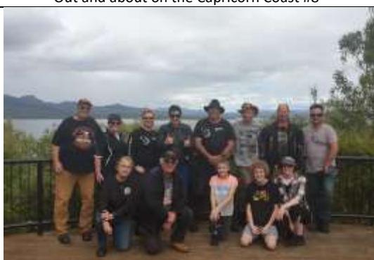
Out and about on the Capricorn Coast #11