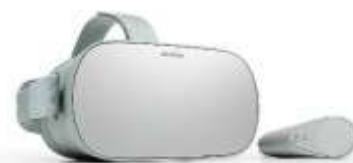
New VR Headset recently purchased

With all this going on our website unfortunately is still a work in progress however will continue to work on this in the coming months. The website is located at: www.ourcommunityfrasercoast.com.au is still under construction.