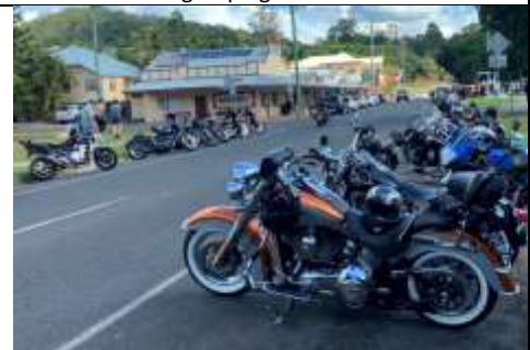
Lunch stop at Imbil #2