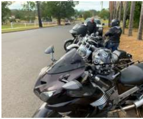
Show day Weekend