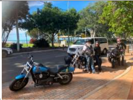
May on the Fraser Coast #2