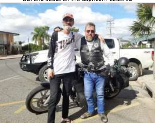
Out and about on the Capricorn Coast #5