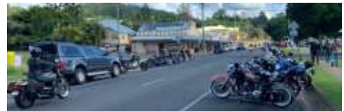
PIC #1 Meeti Granville PIC #2 & #3 Lunch stop Imbil