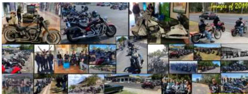
Banner example above 2.6x1 metre (approx.). $75 plus postage