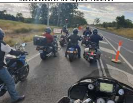
Out and about on the Capricorn Coast #8