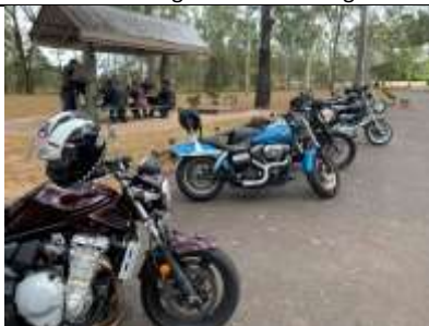
Lunch and drinks in the park - Howard