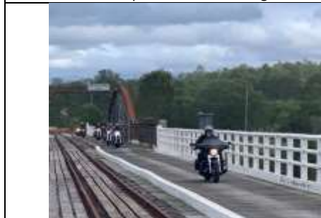
Bikes crossing Dickabram Bridge #1