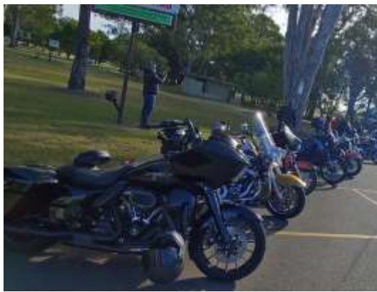
Lined up at Granville