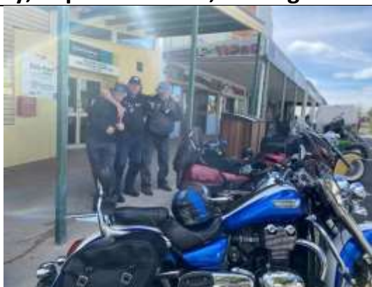
Out and about on the Capricorn Coast #2