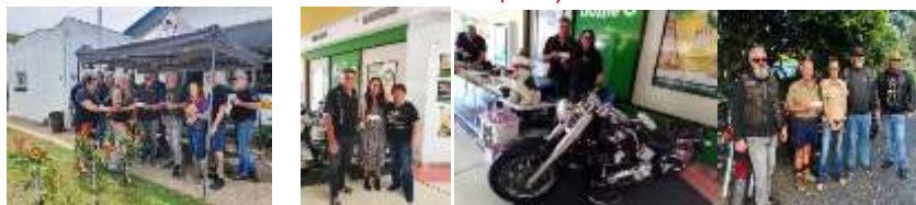
Brought to you by eatmyshorts.com.au

On the 27 th of December 2013, Independent Riders Australia presented its first check of, $1500 to Spina Bifida Hydrocephalus Qld. On Saturday 20 th December 2014 we signed our last cheque for 2014, bringing our total donation of cash, services and goods for the twelve-month period to: $22,324.85 . December 2017 saw this amount exceed $90,000 and by December 2019 this amount exceeded $150,000.