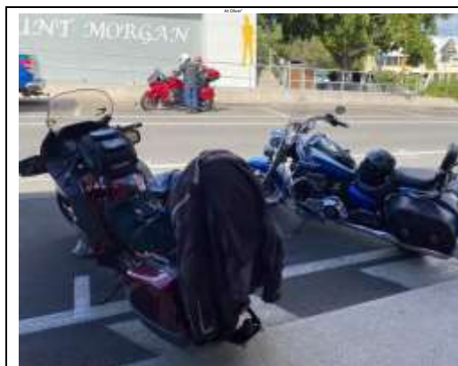
Out and about on the Capricorn Coast #1

Moreton Bay, Capricorn Coast, Darling Downs xxxx