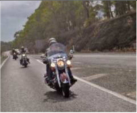
May on the Fraser Coast #6