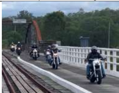
Bikes crossing Dickabram Bridge #2