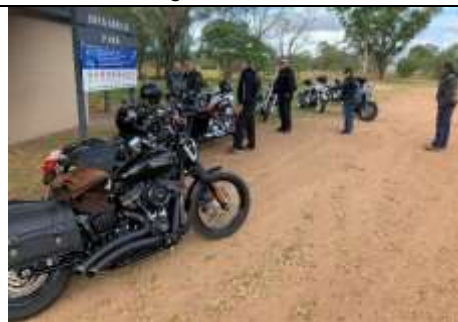
Parked up at Dickabram Bridge #2