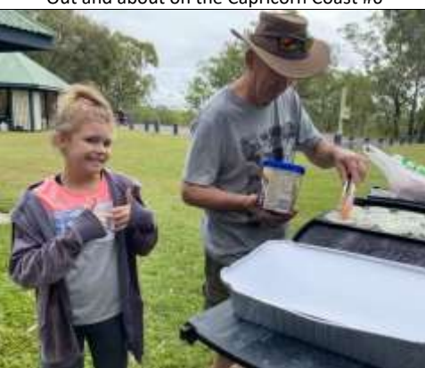
Out and about on the Capricorn Coast #9