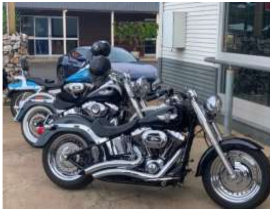
Coffee at Retro's Tinana