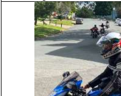
Spike heading out from Kin Kin