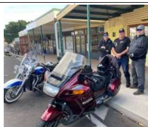
Out and about on the Capricorn Coast #3