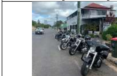
Bottle shop and food stop