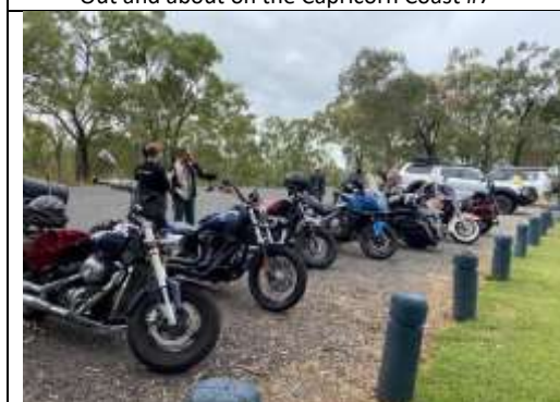
Out and about on the Capricorn Coast #10