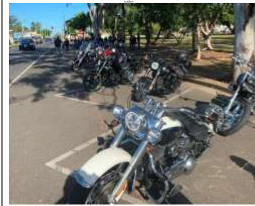
Starting from Granville