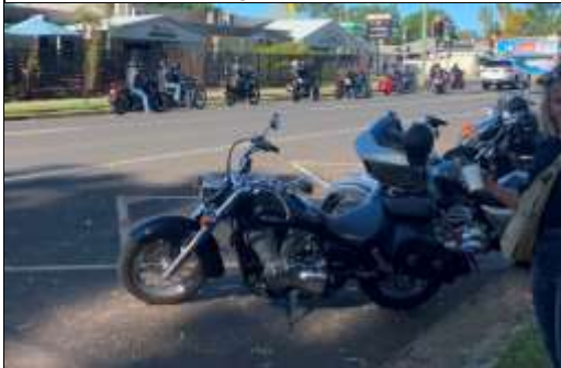
Bikes heading out – Imbil via Kin Kin and Traveston