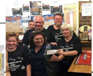
Moreton Bay Buy a Bale Charity Ride