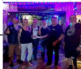
Chq presentation MACE Tou Run Raffle